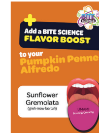
Anatomy Of Taste Flavor Boost Cling