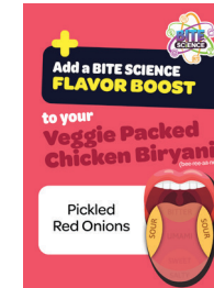
Anatomy Of Taste Flavor Boost Cling