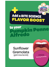
Anatomy Of Taste Flavor Boost Cling