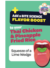
Anatomy Of Taste Flavor Boost Cling