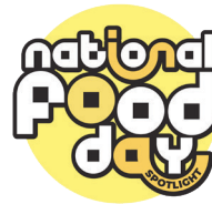
National Granola Bar Day

1/16 International Hot & Spicy Food Day - Feature a Nashville Hot Chicken Sandwich or one of the "spicy" or "hot" Scratch-made Secondary LTOs like the Spicy Turkey Sub or Hot Honey Pepperoni Pizza