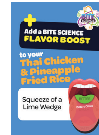
Anatomy Of Taste Flavor Boost Cling